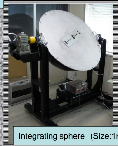
Integrating sphere (Size:1m)